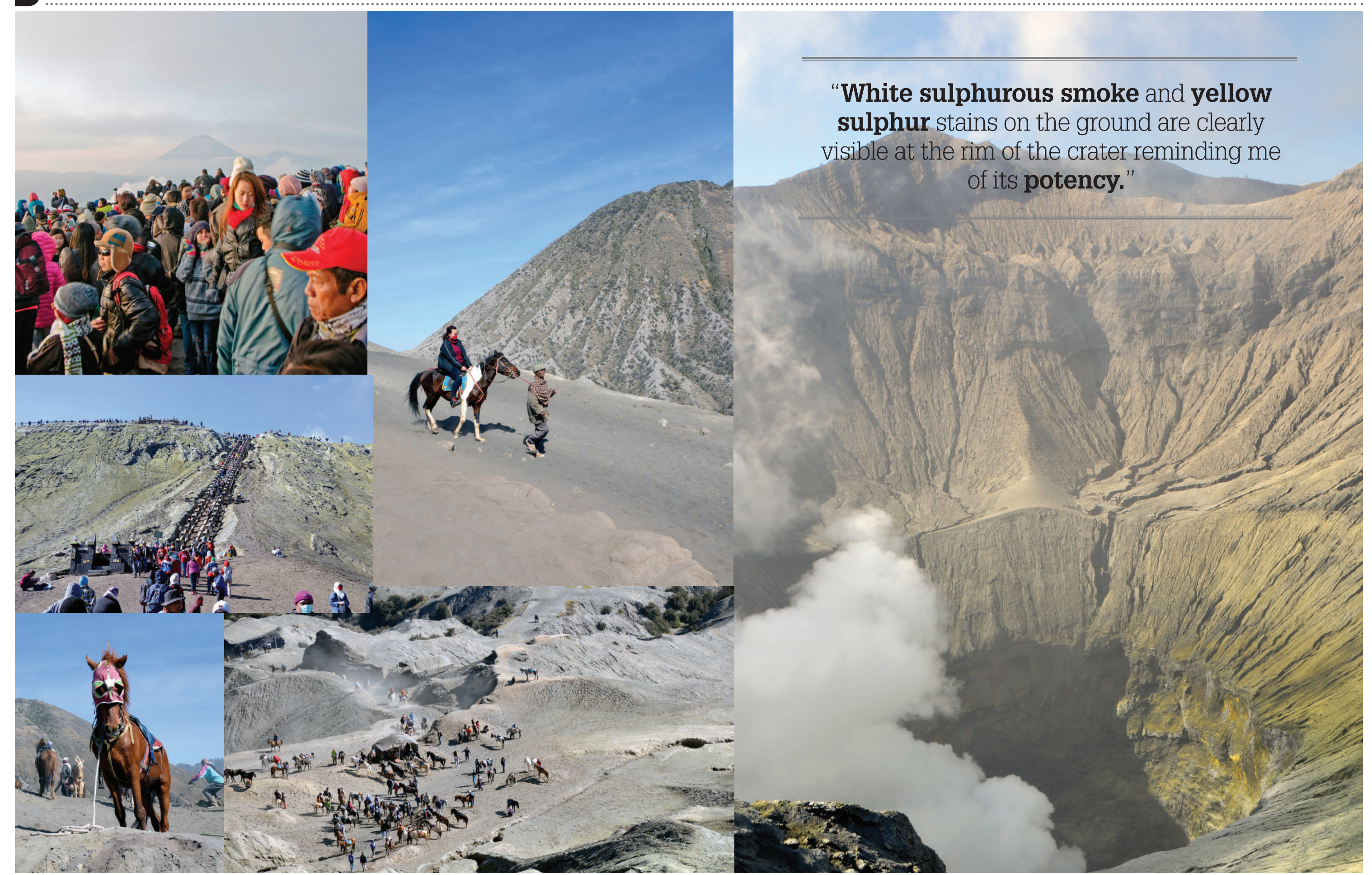
www.asianjourneys.com.sg | April/May 2016 AsianJourneys