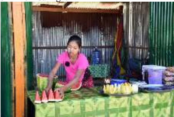
At a water melon stall, a local girl covered her face with thanaka.

Leaving Yangon for Bago next morning we were soon clear of traffic and into the countryside. Monks were collecting alms and roadside stalls sold fruit and ceramics. Women and girls covered their faces in thanaka, a natural, environmentally friendly cosmetic made from roots or branches of the thanaka tree, to protect the skin from sunlight