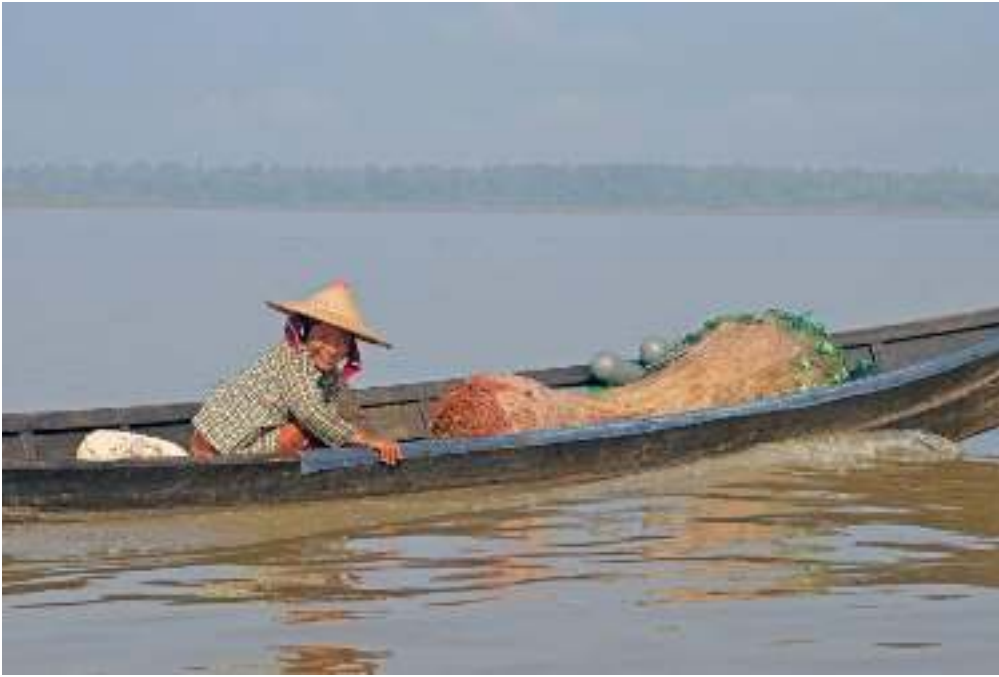
Fishing on Thanlyin River

Myanmar certainly didn't disappoint – it is an amazing place for tourism!