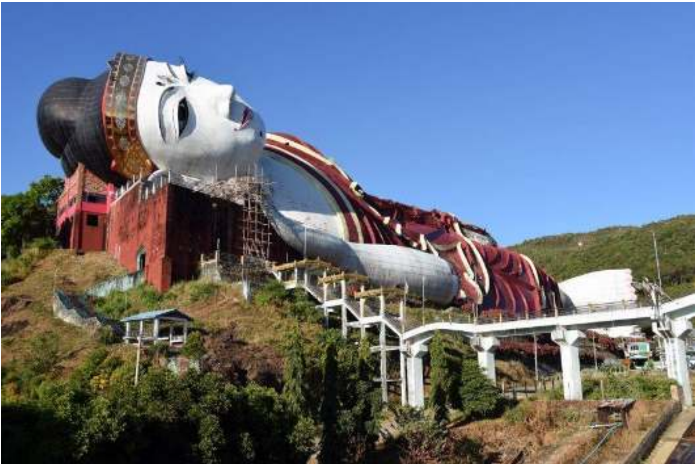
Reclining Buddha - Win Sein Taw Ya.

En route I saw more evidence that Religion can make one do crazy stuff! The approach to Win Sein Taw Ya is truly fascinating with hundreds of monk statues lining the road. The shadows are surreal, as is the uncompleted world's largest reclining Buddha despite ongoing construction over 17 years.