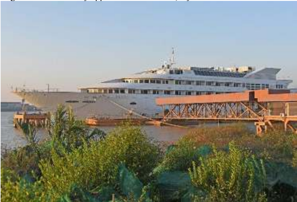
Vintage Luxury Yacht Hotel

We drove leisurely back to Yangon the next day for dinner at the excellent Prime Grill restaurant then I spent my final night in Myanmar on a cruise boat moored on the river. The unique Vintage Luxury Yacht Hotel with its classic 1920's, retro layout and great location continues to re-invent its brand to appeal to a larger market that fully appreciates its themed, stylish decor.