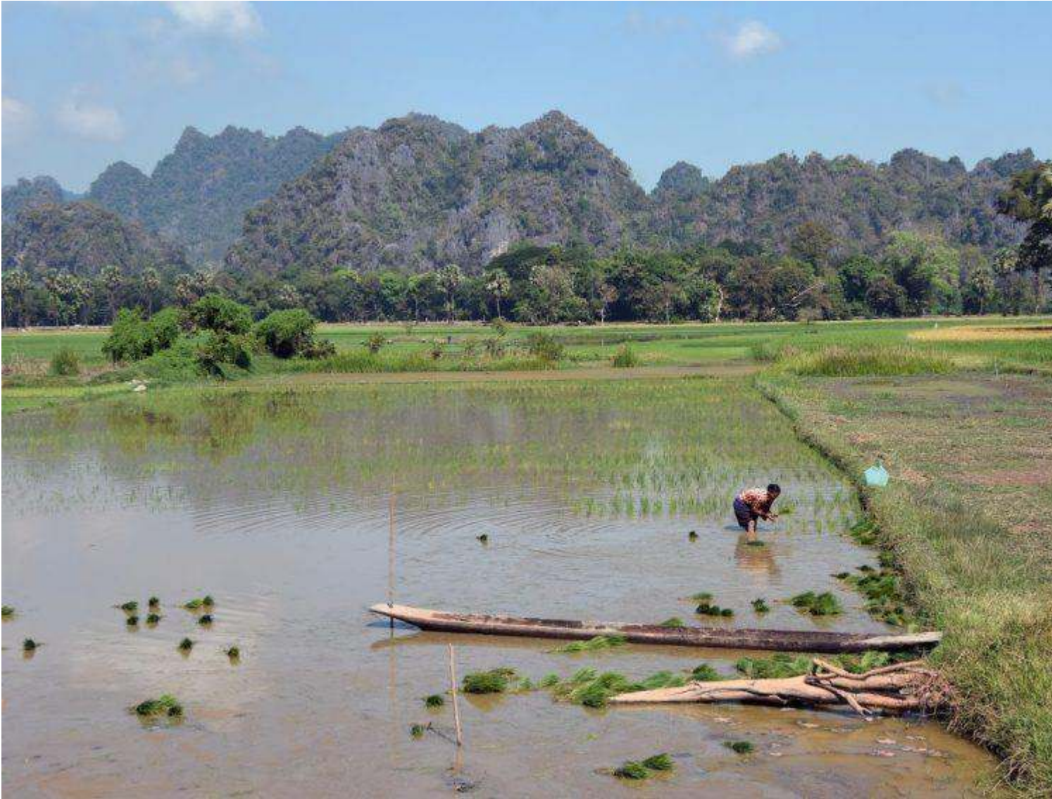
Planting rice in Myanmar.