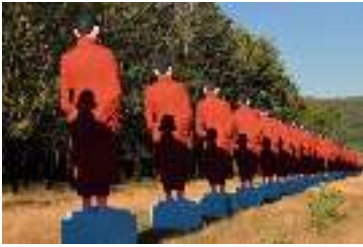
Monk statues Win Sein Taw Ya