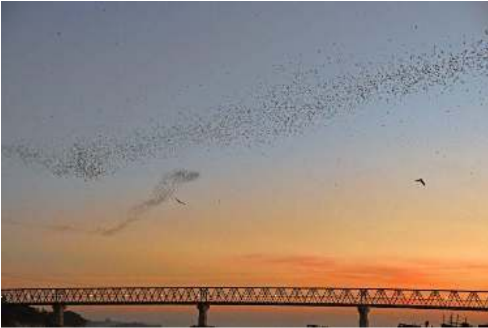
Bats flying out of the Hpa-An Bat Cave.

The highlight of this trip was the bats exiting their cave in their millions flying low above my head as the sun was setting. A dozen black hawks had a feeding frenzy on unlucky stragglers.